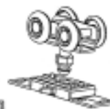
HANGER 1- 1750HDW